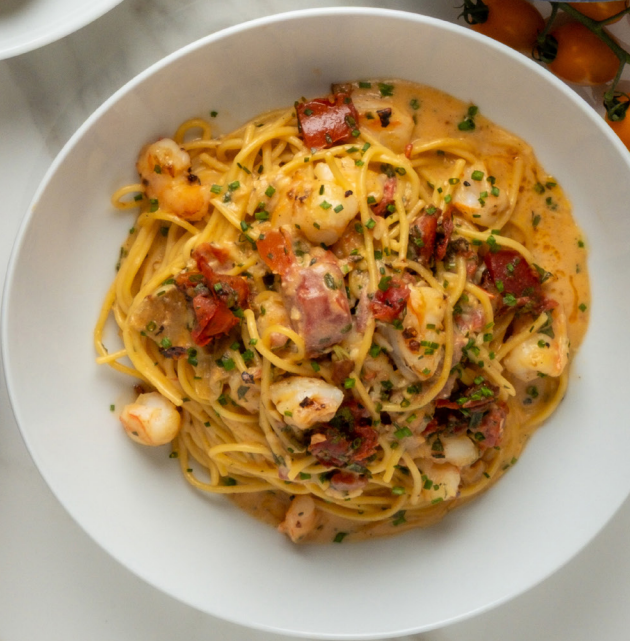
PRAWN BUTTER PASTA